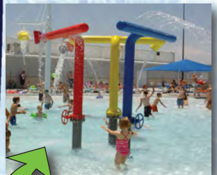
SoftSide Padded Flooring

Ask about our SoftSide Padded Flooring for use on entire floor area installations.