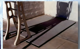
SoftSide Dive Stand Safety Pad